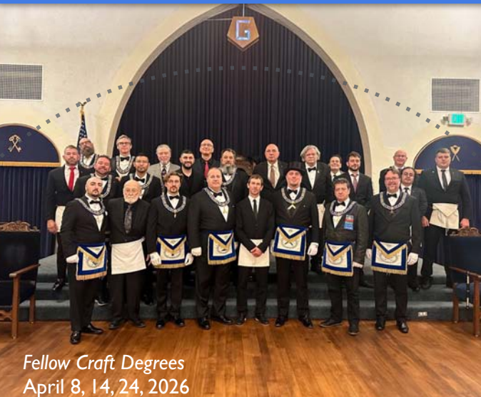
Fellow Craft Degrees April 8, 14, 24, 2026